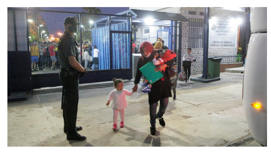
Migrants walking towards a bus to cross the Strait of Gibraltar, Melilla