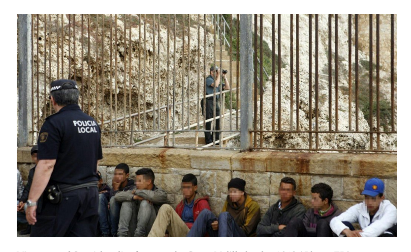
Migrants and Spanish police forces at the Ceuta-Melilla border, 2018